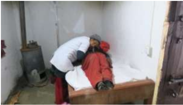
ANC Check-Up at the Birthing Centre at Bhadgau, Jumla