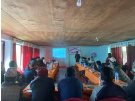
Teachers training on ASRH at Manma, Kalikot