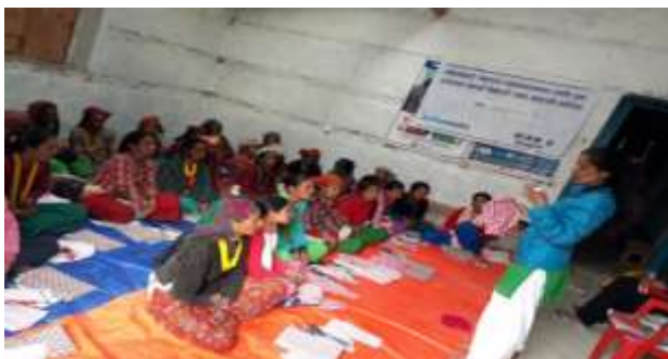
Sanitary pad making training at Boharabada, Humla