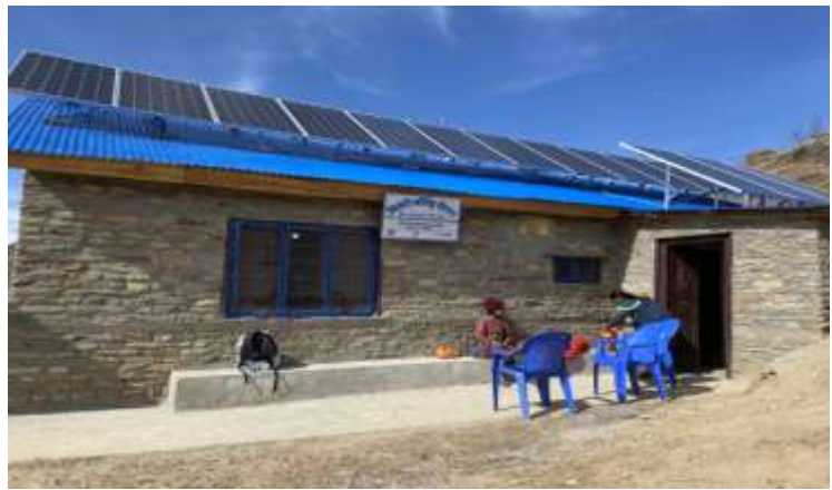
Miteri Birthing Center at Bhadgoun, Jumla

This project has been designed to improve the maternal health status of women of a remote part of Jumla with the construction and operation of a birthing center.