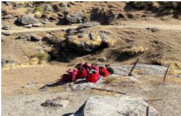
Interaction with mothers group members during field visit by central team