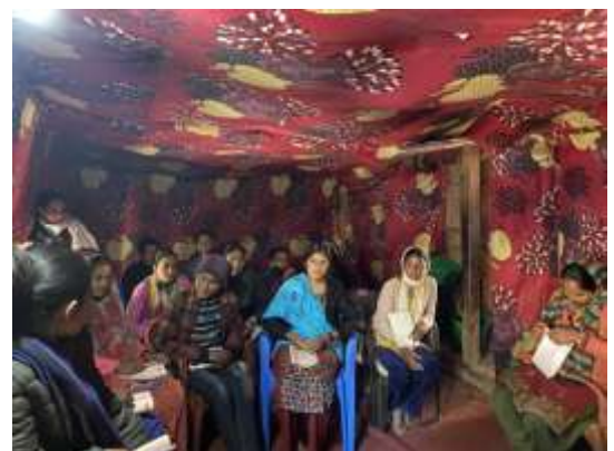
Youth Groups Training at Kalikot