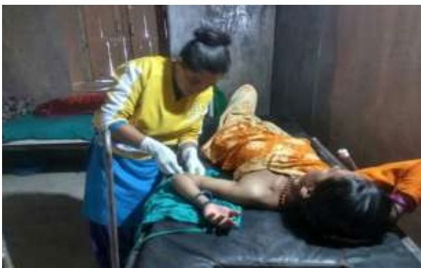
Implant service provided by ANM at Health facility in Kalikot