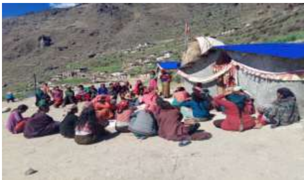
Health Mothers Group Meeting at Kalikot