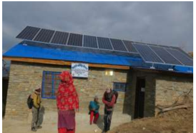
Birthing Centre at Bhadgau, Jumla