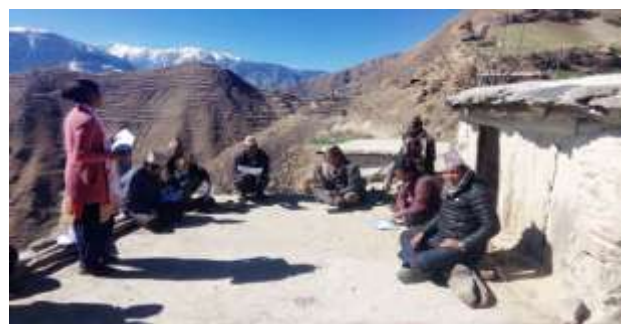
Male Groups Meeting and discussion on Safe Abortion and Family Planning by CF