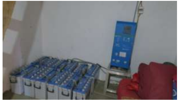
Solar equipment's at Birthing Centre at Bhadgau, Jumla