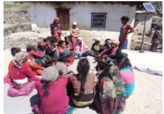
Interaction on family planning and safe abortion with female members from the community at Kalikot