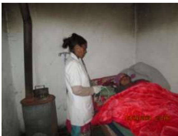
Post-delivery treatment at the Birthing Centre at Bhadgau, Jumla

As for the progress so far, the building construction and equipment set up at Miteri Birthing Centre, Bhadgoun, were completed in April 2019. Despite the hardships, the construction of the birthing center and the installation of the necessary equipment have all been completed and now, it is fully functional starting from last year (2020).