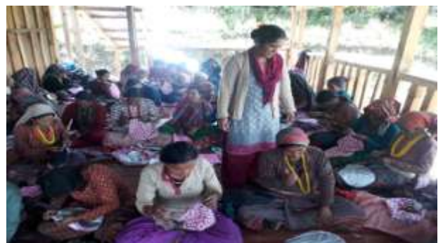
Sanitary pad making training at Bama, Mugu