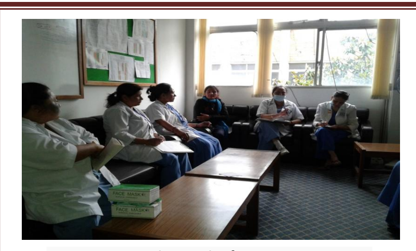
AWON team organize meeting for emergency response

AWON team organized meeting for emergency response mostly to affected area. The meeting decided to make an Emergency Response Committee (ERC) with a leadership of Founder, President