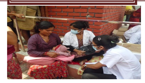
Nurses checking patients and counseling