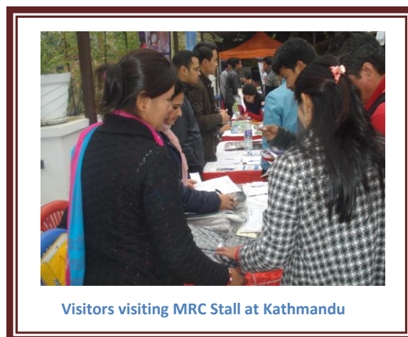
Visitors visiting MRC Stall at Kathmandu

As a part of livelihood improvement, AWON had started Miteri Recycle Center (MRC), a social business to manage livelihood improvement program on a sustainable basis. The activity is also selected to provide humanitarian support to the target beneficiaries at the time of emergencies. As per the motto of lead strategy "Miteri Gaun: Let's Live Together" campaign, AWON collects second hand/used clothes from various places, recycled them and sell them in minimum/ low costs in the program areas. Till date, AWON has reached in four districts Jumla, Kalikot, Dailekh and Humla. AWON receives cloths and others necessary items whatever people wanted to donate in the peace culture for Miteri Gaun. Once the clothes reached to the MRC, the cloths are well washed, repaired, stitched, ironed, labeled and packed well and look like retail items rather than donations, and sold at a price that is affordable to the poorest consumers/ people. This preserves the dignity of the people buying the clothes.