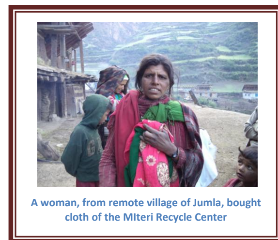
A woman, from remote village of Jumla, bought cloth of the Miteri Recycle Center

As part of income generating activity, AWON is now focusing to start Miteri shop in Jumla to support poor, marginalized and single women. This year, AWON supported 4 women as retailers to sale recycled cloths in their villages. The women receive 10% income of the total sell to help them to support their daily life expenses, to save money to expand their business and to send their children