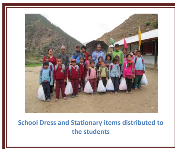
School Dress and Stationary items distributed to the students

Every child has rights to education. AWON works with the remote, marginalized and underprivileged children and their families to ensure that right is realized and these children get the opportunity to thrive. As part of education support program, AWON has provided scholarship support to poor students in Jumla, and Kalikot districts of Karnali, one of the most remote and marginalized regions of