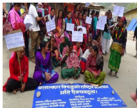
AWON along with different organizations showing solidarity in Jumla against Anti- Rape campaign