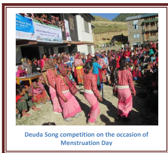
Deuda Song competition on the occasion of Menstruation Day

May 28th, 2014, AWON celebrated Menstrual Hygiene Day by organizing different programs with the school children of Lamra VDC of Jumla.