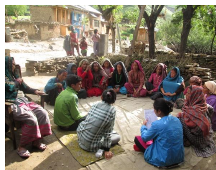
Meeting with women groups in Lamra VDC, Jumla

As part to support National Anti-Rape Campaign, AWON together with other like minded organizations, took a lead role to organize Dharna (sit in) program, and presented an attention paper to the District Administration Office in Jumla. And also as a partner organization, AWON is continuously showing its