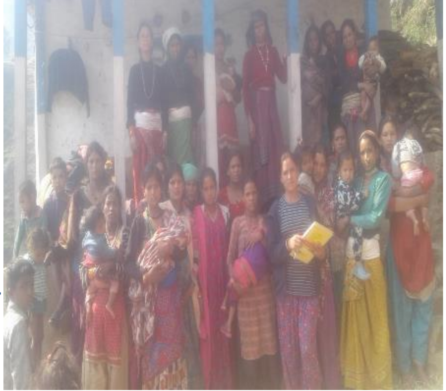
Women participants of health mother group at Sukatiya

Including meeting at the health mother groups formation, two bi-monthly meetings was conducted by each mother groups on March/April and June. All together 254 meetings were conducted to discuss the issues of awareness on safe abortion, contraception services and SRHR.