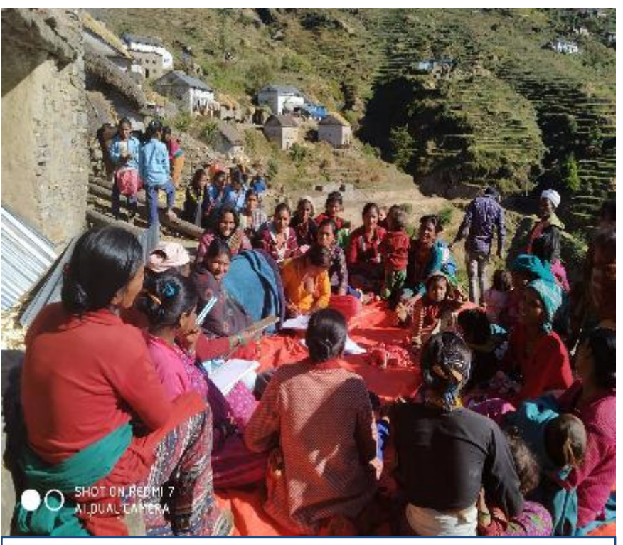
Women discussing about SRHR issues during health mother's group meeting