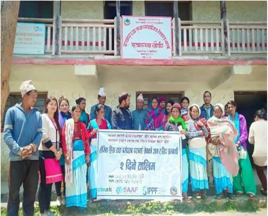
Participants at photo session after training at Chilkhaya Health Post