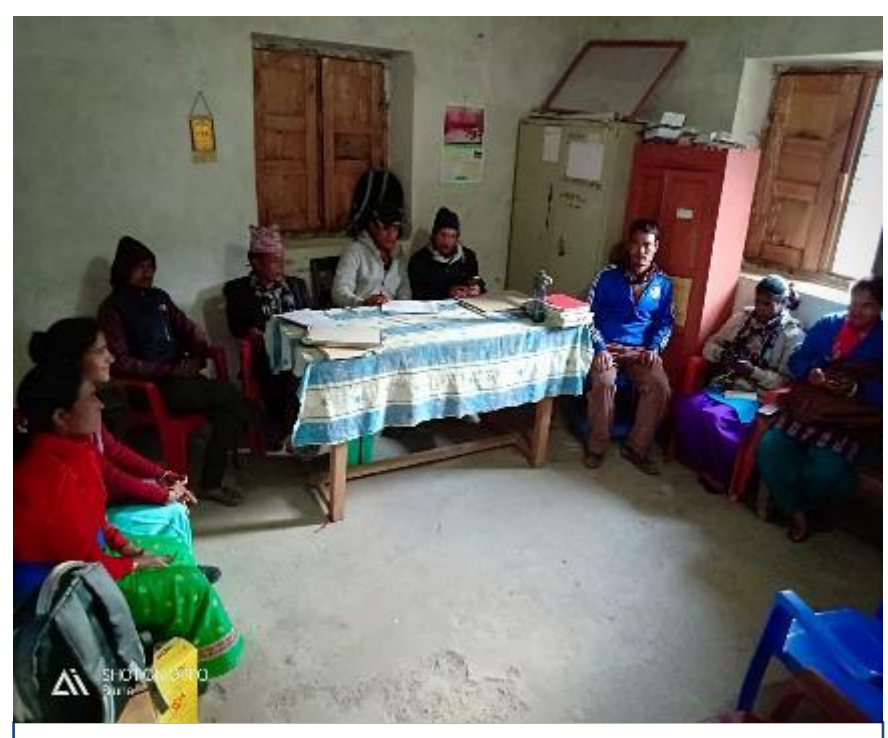
HFOMC meeting at Mumra HF