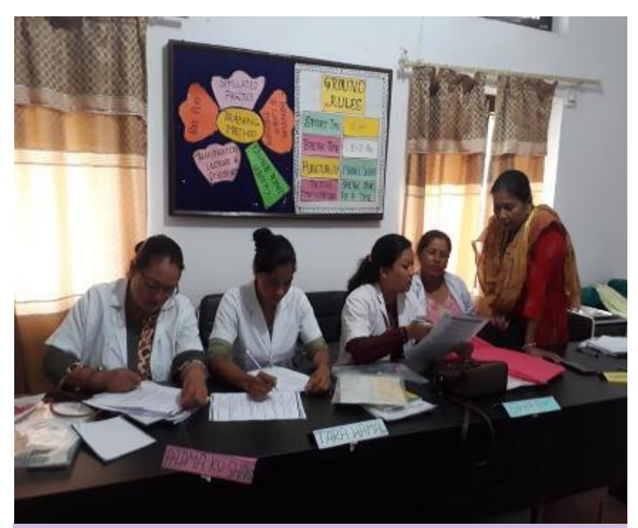
Participants at theory session during Implant training at Bheri Hospital, Nepalgunj.