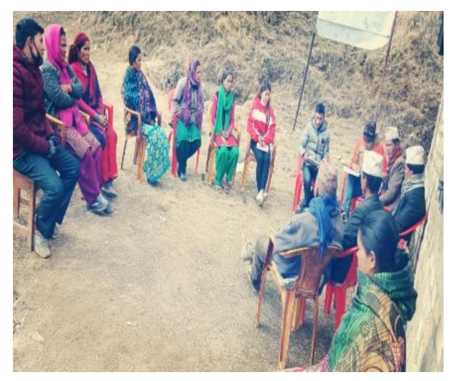
Fig. Discussion among HFOMC members during bi-monthly meeting at Chhapre Health Post.

• Similarly, two bimonthly meetings were also conducted at each HFOMC in 15 project health facilities. Five facilities could not conducted the second time meetings due to formation process delay.