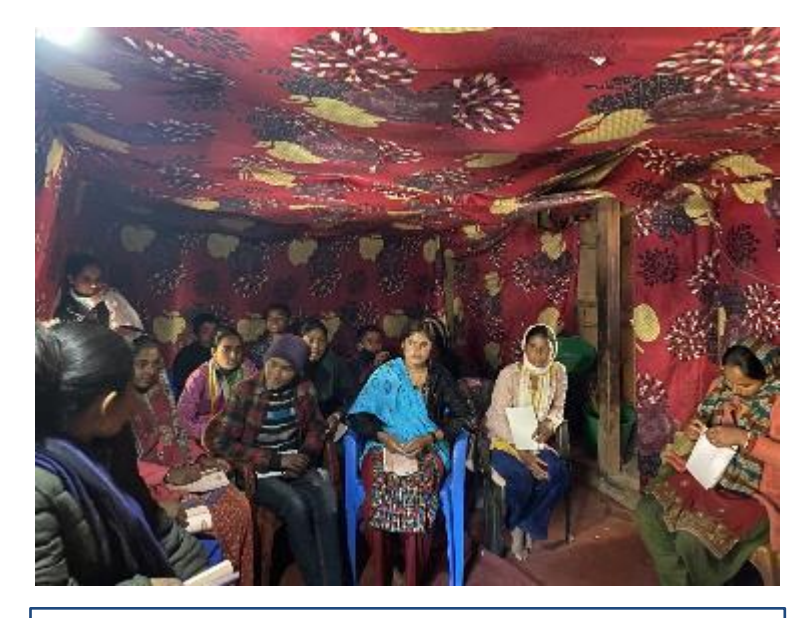
Youth dialogue and interaction program at Tilagufa Rural Municipality