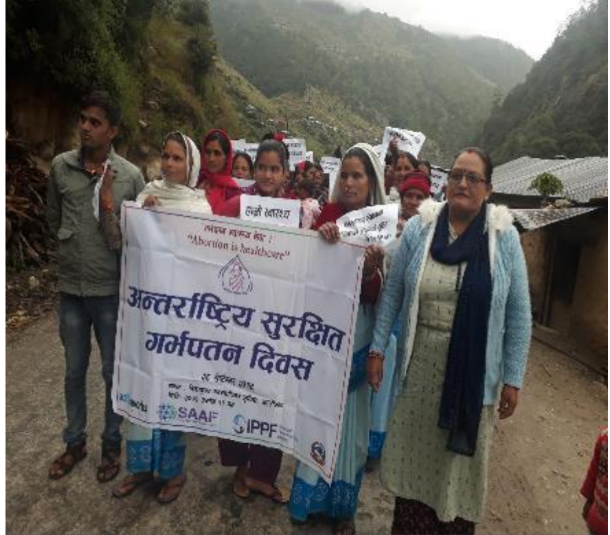
Rally headed by FCHVs on the occasion of international safe abortion day