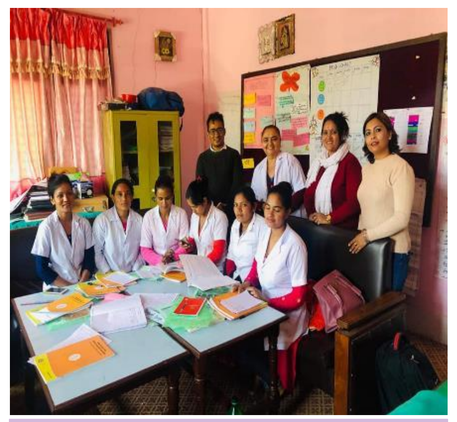
Participants with trainers and AWON team during MA training at Seti Hospital, Dhangadhi.