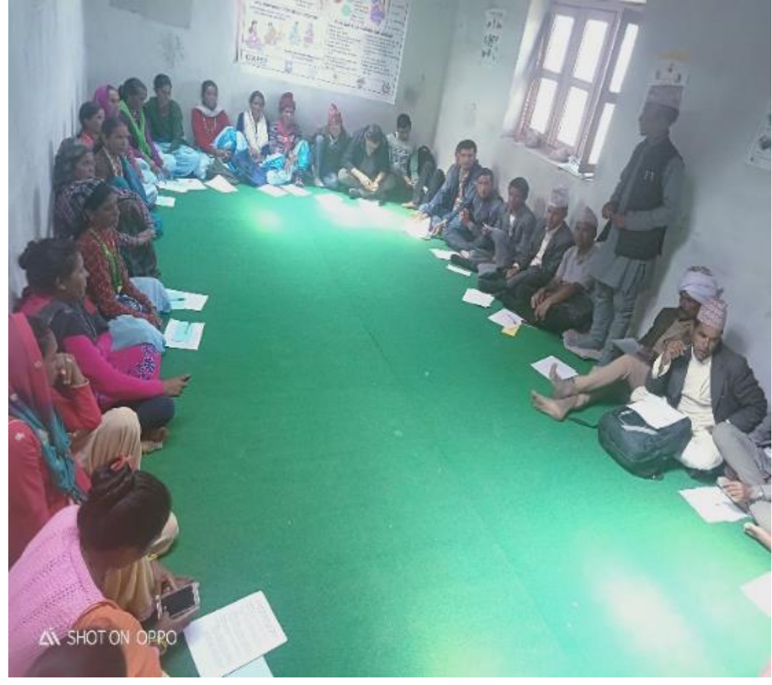
Photo 1. Participants at community level project orientation at Chilkhaya Health post