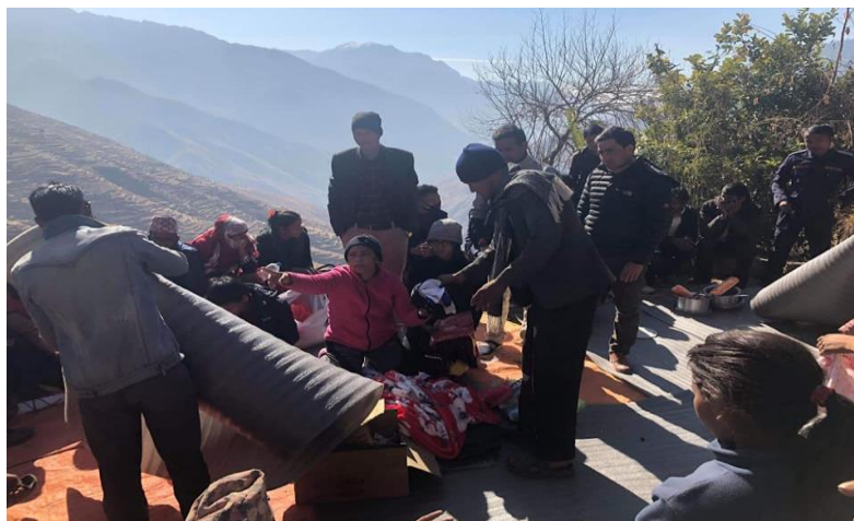
Fire victims receiving relief materials

AWON provided Kitchen Utensils, plates, toothpaste, sanitary pads, soap, mattress, woolen caps, baby blankets, child jackets etc. for 45 families.