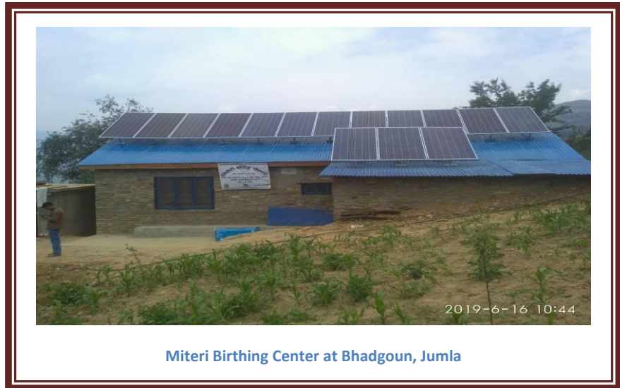
Miteri Birthing Center at Bhadgoun, Jumla

AWON has been focusing right to reproductive and maternal health programs in the Karnali region, where women are not aware of their reproductive health rights and have little access to basic health services. The Karnali region has highest Women of Reproductive Age (WRA) deaths rate (310/100'000) and the second highest MMR (275/100'000; MMS, 2008). Infant, under-five and neonatal mortality rates are both above the region (DHS, 2016). To address these problems, AWON launched a pilot project in November 2012 entitled “Miteri Birthing Center “(MBC) in