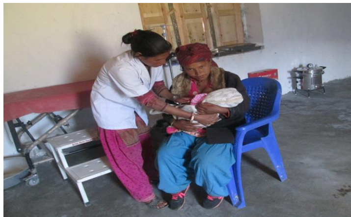
ANM supporting breastfeeding during PNC at Bhadgau, Jumla

The building construction and equipment set up at Miteri Birthing Centre Bhadgoun was completed by April 2019. Since May 2019, the delivery services has been started though the inauguration of the center was formally done on 29 th May 2019. Till the end of June 2019, a total of six deliveries has been assisted by SBA at the center. The solar set up at the birthing center was done on last week of the June. Now the birthing center is equipped with required equipment and materials, essential medicines, SBA trained