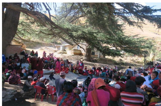
Chhaupadi goath free declaration event at Tatopani, Jumla

commitment to make their village free from chhaugoath in coming days even after end of the