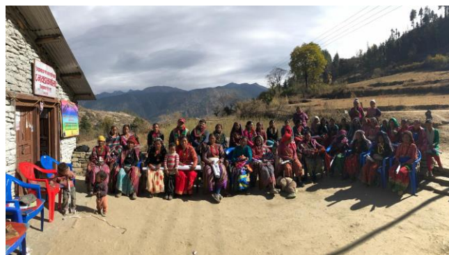
Monitoring team with beneficiaries and government stakeholders during field visit.

observation, the evaluation report was prepared and submitted to SWC and donor. The recommendations made by the team were being implemented for avoiding the repetition and brining good results of the other projects.